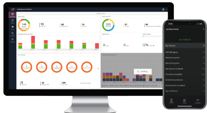
Harmony Mobile Management Console