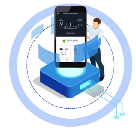
Easy to Deploy and Manage