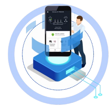
Easy to Deploy and Manage