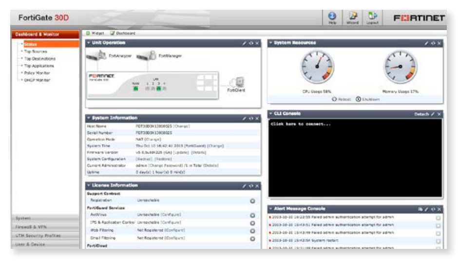
GUI Lite Dashboard - Single Pane of Glass Management

For complete, up-to-date and detailed feature set, please refer to the Administration Handbook and FortiOS Datasheet